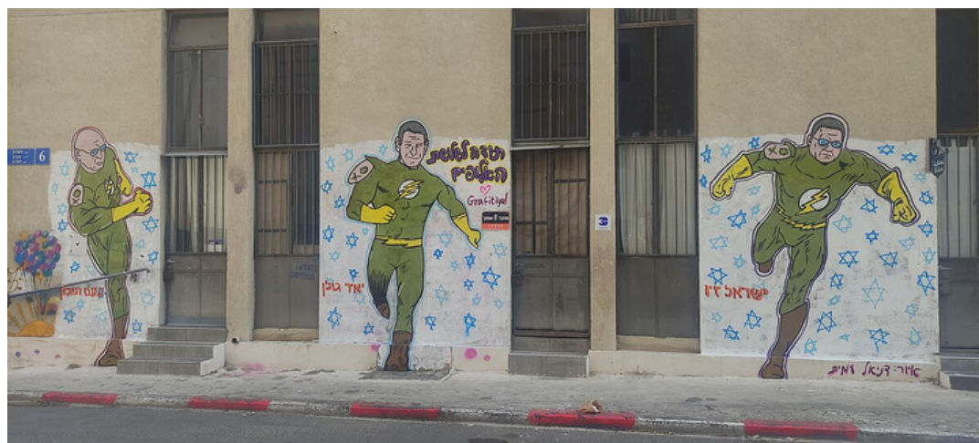
Noam Tibon, Yair Golan, Israel Ziv