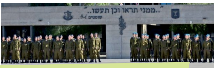
IMG «See my example and do the same...» centrally located in the IDF Officers' School Training Base.

The IDF chose to immortalize Gideon's lesson of personal example, and put it on the wall of the Officers' School, where all soldiers destined to become IDF officers study and train. And indeed, the IDF commanders of today learn about these key values of personal example, and leadership, from the commanding officer and judge who led the Jewish people thousands of years ago.