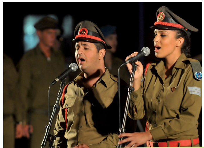
Israel Defense Forces IDF Band Sings 2011

Today, there are even young men and women with special needs or disabilities who can contribute their talents and be part of the People’s Army. Their service is voluntary.