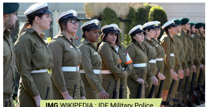
IDF Military Police