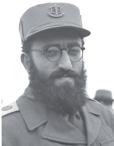
Rabbi Shlomo Goren, the first Chief Military Rabbi for the Israel Defense Force

The IDF is a significant part of Israeli identity, and carries great value in creating connections within the people and bridging gaps between the different Israeli sectors and cultures.