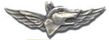
The Oketz emblem